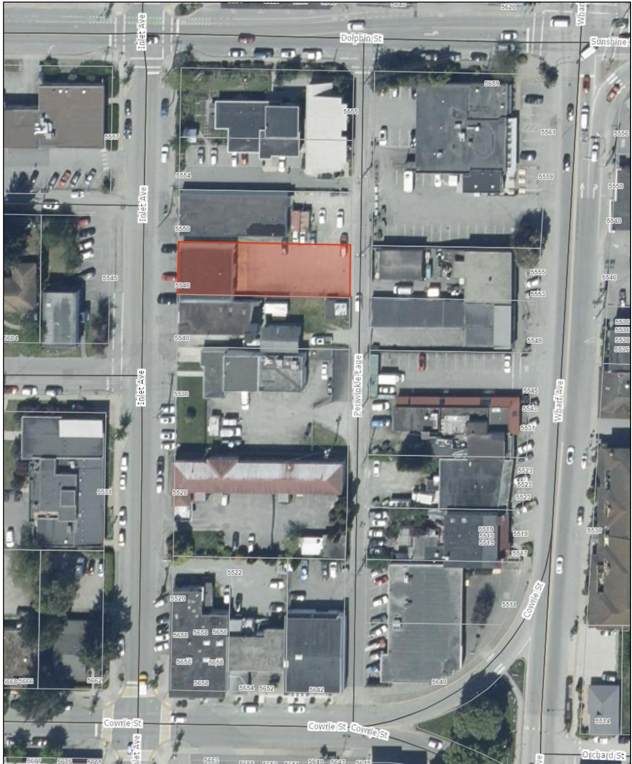
Figure 2 – Aerial image 2021 showing surrounding area