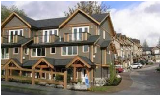
Use of wood, mixed building designs and other features create a good fit with the neighbourhood.

Creating attractive, distinctive and appealing neighbourhoods is an important goal of the OCP. Careful use of the development approval process is required to create high quality built environments that respect and fit within the neighbourhood context. Use of local materials, with an emphasis on wood, is a goal of the Development Permit Area guidelines. OCP policies require preservation of natural site features and provision of